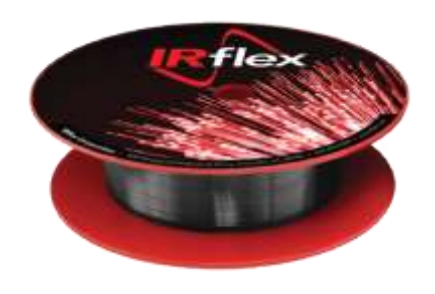
Attenuation Spectrum for IRF-Se series

IRflex's IRF-Se Series long-wave infrared (LWIR) fiber, made from extra high purity chalcogenide glass As_2Se_3 , is specially designed and manufactured to generate and/or guide mid-infrared wavelengths from 1.5 to 10µm with high transmission efficiency and nonlinearities about 1000 times that of silica glass fiber.